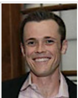
Founder & CEO